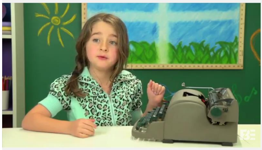
KIDS REACT TO TYPEWRITERS

https://www.youtube.com/watch?v=vfxRfkZdiAQ